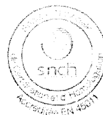
Gilles AST expert technique